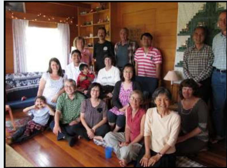
Our co-workers in our region are a very international bunch! Japanese, Korean, Costa Rican, New Zealand, and Austrian as well as a few Americans