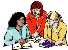
Women's Bible Study